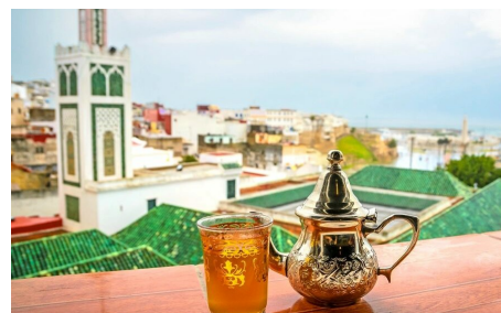
Tangier Medina and mint tea