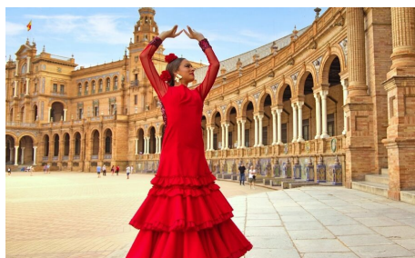
Plaza in Seville, Spain

Cross to North Africa for a visit to Tangier's historic 18th-century kasbah and its lively markets. Then, sail up the Guadalquivir River to the ancient Andalusian city of Seville, where the awe-inspiring Seville Cathedral stands as one of Europe's greatest Gothic masterpieces. In Portugal, discover the charm of the fortified coastal town of Lagos along the sun-kissed Algarve. Enhance your journey with an optional pre-tour in Barcelona and/or a post-tour extension in Lisbon for an even richer Iberian experience.