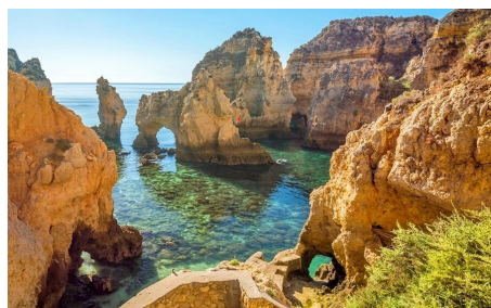
Ponta da Piedade Cliffs, Lagos, Portugal