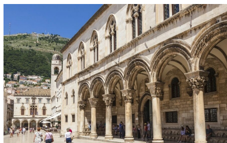
Rector's Palace, Dubrovnik, Croatia