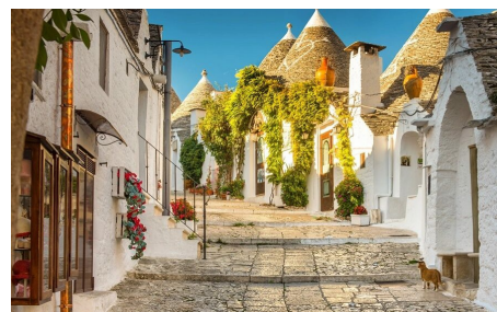
Trulli of Alberobello, Italy